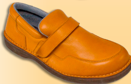
D-WORK RELAX Model GALÉNOS ČSN EN 79 5600:2005 Men's outdoor footwear size: 41-48