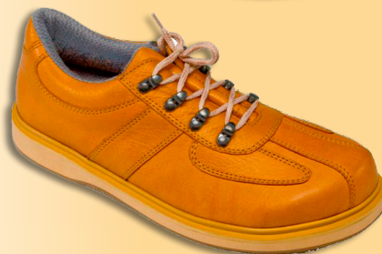
D-WORK RELAX Model ISIS ČSN EN 79 5600:2005 Ladies' outdoor footwear size: 37-42