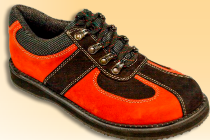
D-WORK RELAX Model ENERGY ČSN EN 79 5600:2005 Ladies' outdoor footwear size: 37-42

Ask your diabetologist specialist or podiatrist about D-WORK shoes.