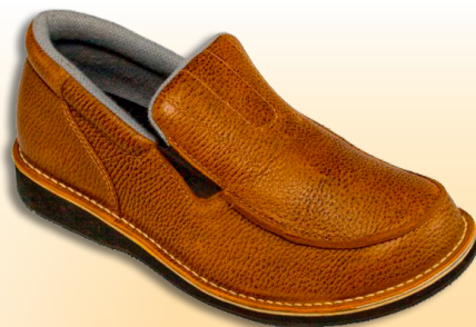
D-WORK RELAX Model FREEMAN ČSN EN 79 5600:2005 Men's outdoor footwear size: 41-48